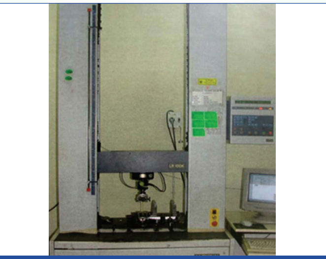
[Table/Fig-3]: Sample mounted on the LLOYD Universal testing machine.

An Instron testing machine with a 10 N tension load cell, calibrated, that allowed the sliding of a bracket along the orthodontic wire was used in the study. The frictional forces generated were measured at room temperature in dry conditions. The acrylic sheets with the bracket and wire were attached to the crosshead of the testing machine [Table/Fig-3]. The archwire was drawn through the bracket under tension to a distance of 1.25 mm with a constant crosshead speed of 1 mm/minute [18]. The recorded frictional resistance values that were obtained in Newton were converted to grams.